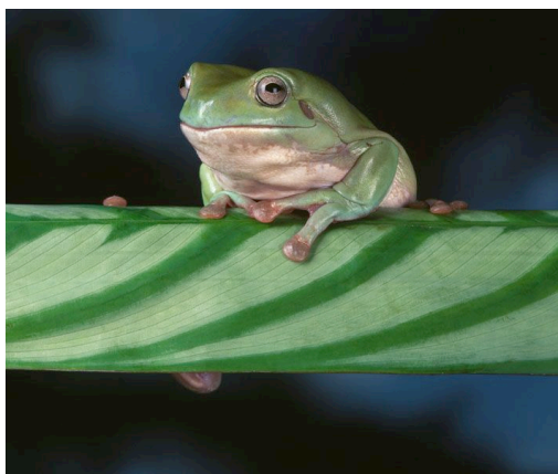
A tree frog from Australia. This frog is arboreal .

Amphibians generally lay soft, jelly covered eggs into an aquatic environment. Thousands of eggs may be laid, but mortality is very high. The eggs hatch into larvae, also known as tadpoles, and these eventually undergo a shape changing metamorphosis into the adult form. These young adults then leave the water and adopt a more terrestrial lifestyle.